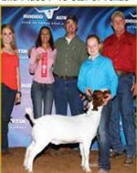
2nd Place I '13 Star of Texas