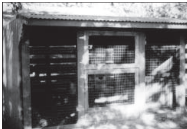
A typical building used for growing broilers or roasters for a youth project.

Be prepared for the chicks 2 days in advance. Put at least 4 inches of litter on the floor of the cleaned, disinfected house. Wood shavings, cane fiber, coarse